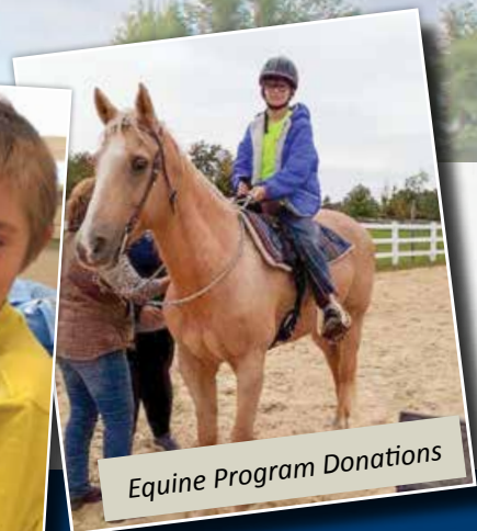
Equine Program Donations