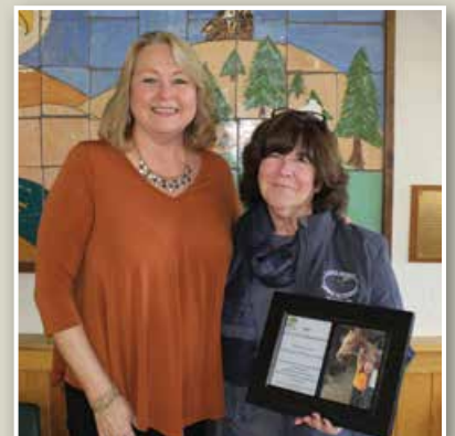
12 th Annual You've Got a Friend Award Lakes Region Riding Academy