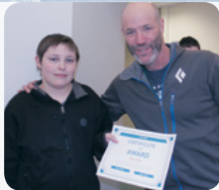
Student Receives Kotcha Card