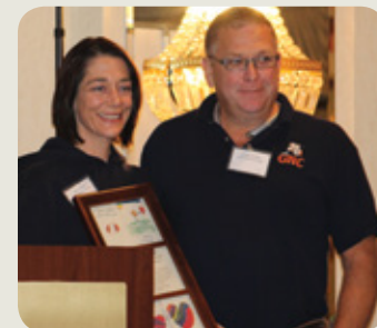
10 th Annual Arthur H. Nighswander Community Partner Award Great Northern Cleaning

Spaulding Youth Center was proud to publicly recognize two community award recipients this year. The Arthur H. Nighswander Community Partner Award was presented at our annual fundraiser Experiencing Childhood to a long-time vendor and partner, Great Northern Cleaning. For 28 years, Great Northern Cleaning has been a trusted part of the Spaulding family and we deeply value their unwavering professionalism.